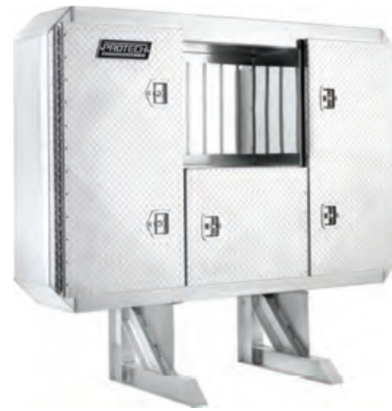
PRODUCT NUMBER SHOWN: 10-1153 DESCRIPTION

MODULAR ENCLOSURE CAB RACK with internal uprights and three 14" deep compartments in a mill-finished body with stainless steel locking T-latches on diamond plate doors; a chain hanger (5903NL) is in each outside compartment.