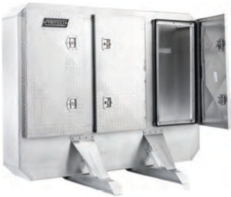
PRODUCT NUMBER SHOWN: 10-1167 DESCRIPTION

MODULAR ENCLOSURE CAB RACK with internal uprights and three 14" deep compartments in a mill-finished body with stainless steel locking T-latches on diamond plate doors; a chain hanger (5903NL) is in each outside compartment.