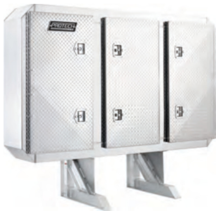
PRODUCT NUMBER SHOWN: 10-1150 DESCRIPTION

ENCLOSURE WITH WINDOW Three door, 14" deep compartment enclosure cab rack with a 27"W x 18"H bar style window (5000) and polished AL body with stainless steel locking T-latches on diamond plate doors; chain hangers are in each outside compartment.