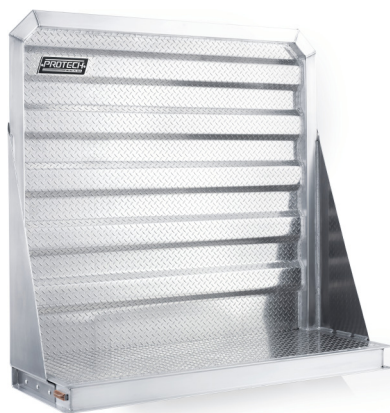
PRODUCT NUMBER SHOWN: 10-1255 DESCRIPTION

DROM ENCLOSURE Three compartment, 14" deep, DROM enclosure with 50 cubic feet of storage, neoprene bulb-type seals and stainless steel locking T-latches on diamond plate doors; a chain hanger (5903NL) is in each outside compartment.