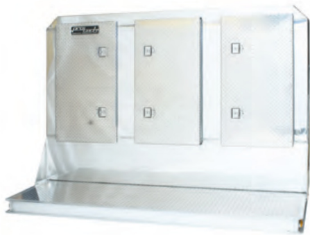
PRODUCT NUMBER SHOWN: 10-2000 DESCRIPTION

DROM ENCLOSURE Three compartment, 14" deep, DROM enclosure with 50 cubic feet of storage, neoprene bulb-type seals and stainless steel locking T-latches on diamond plate doors; a chain hanger (5903NL) is in each outside compartment.